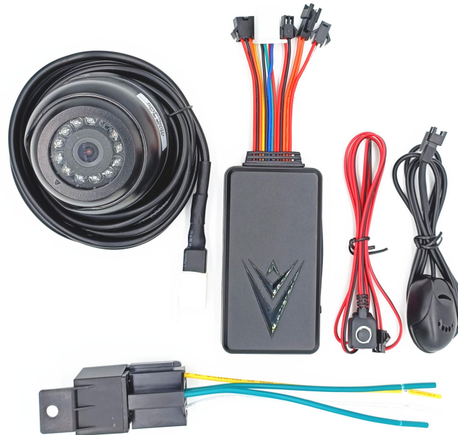
Camera & Relay & ACC & SOS & microphone